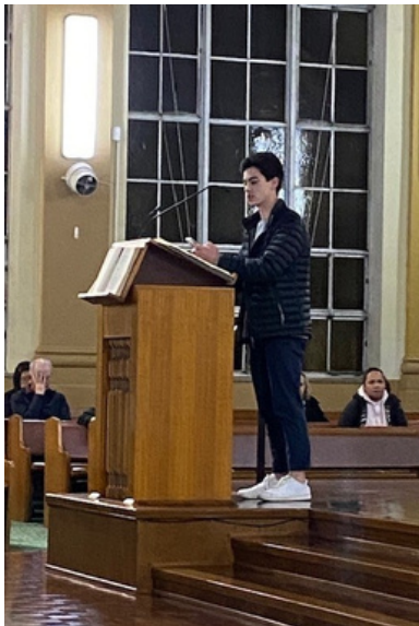
Thank you to the students from Pius for joining us for Mass and supporting the youth Mass!