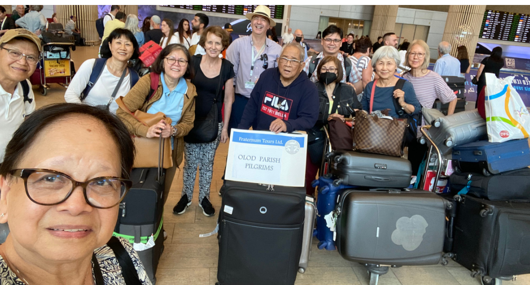
Our Holy Land pilgrims have landed and finished their first full week! They send everyone their love and best wishes.